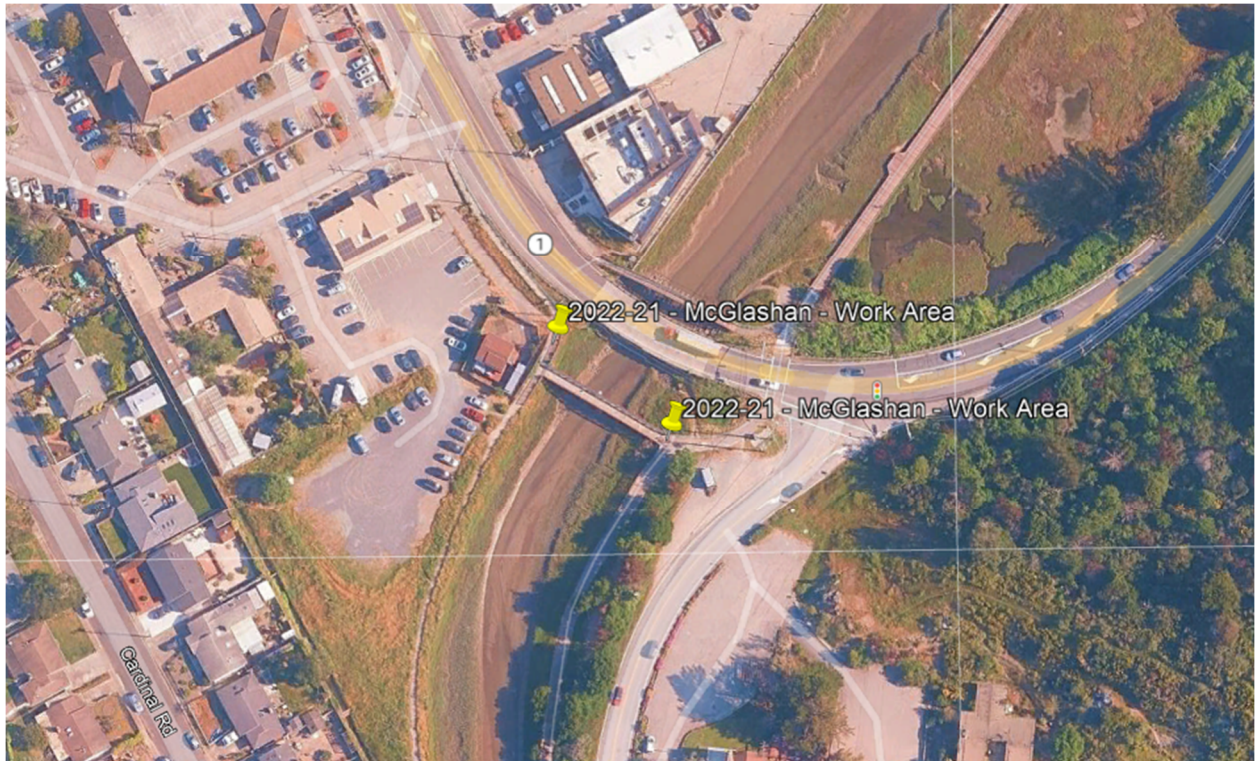
The Pins Show the Work Locations